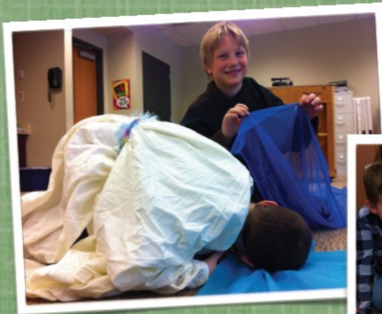
Reenactment: "The Baptism of Jesus"

SUPPORTING CHILDREN AND THEIR FAMILIES AS THEY GATHER, GROW, AND GO IN FAITH